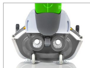
EASY STORAGE AND TRANSPORTATION