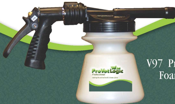
V97 ProFoam 2 Foam Gun

Kentucky Cleaning Solutions, LLC, DBA BLUEGRASS JAN/SAN & PAPER SUPPLIES