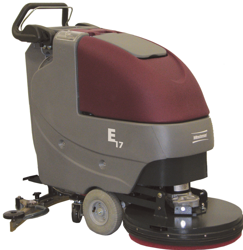
E17 17" Walk-Behind Scrubber