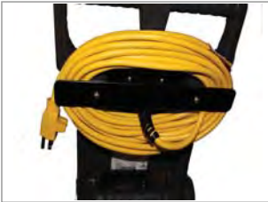
BUILT IN CORD STORAGE