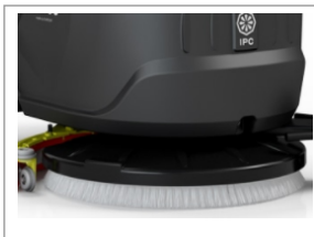
SPIN-ON, SPIN-OFF BRUSH