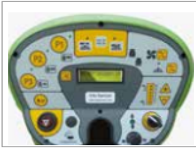
INTUITIVE CONTROL PANEL