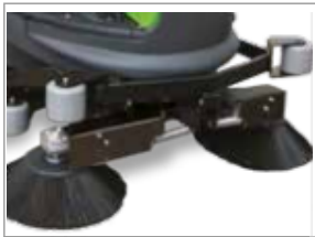
PRE-SWEEP SYSTEM ON CYLINDRICAL MODEL