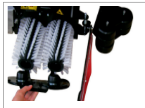
COMBINED SCRUBBING-SWEEPING SYSTEM THAT INCLUDES DEBRIS HOPPER ON CYLINDRICAL