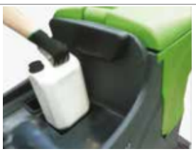
INTEGRATED CHEM DOSE