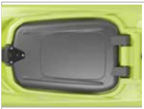
NEW LARGE COVER