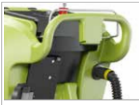
NEW ERGONOMIC HANDLE