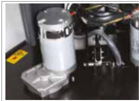
HIGH QUALITY MOTOR GEAR BOX