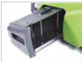
FRONTAL WASTE TRAY