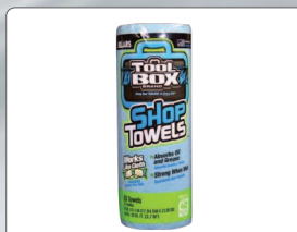
Z400 Roll of Shop Towels

Made With 40% Post-Consumer Recycled Fibers*