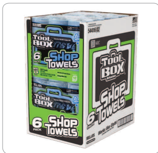
Z400 Roll of Shop Towels 6-Pack Outer Case

**SCOTT is a registered trademark of Kimberly-Clark Worldwide Inc.