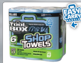
Z400 Roll of Shop Towels 6PK