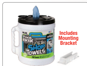
Z400 BIG GRIP® Bucket of Shop Towels