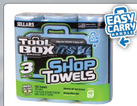
Z400 Roll of Shop Towels 3PK