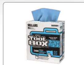
Z400 Interfold Shop Towels