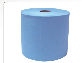
Z400 Jumbo Roll of Shop Towels