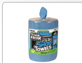
Z400 BIG GRIP® Refill of Shop Towels