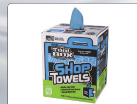
Z400 Box of Center-Pull Shop Towels