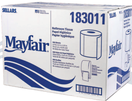
2-Ply Bath Tissue (500ct) Outer Case