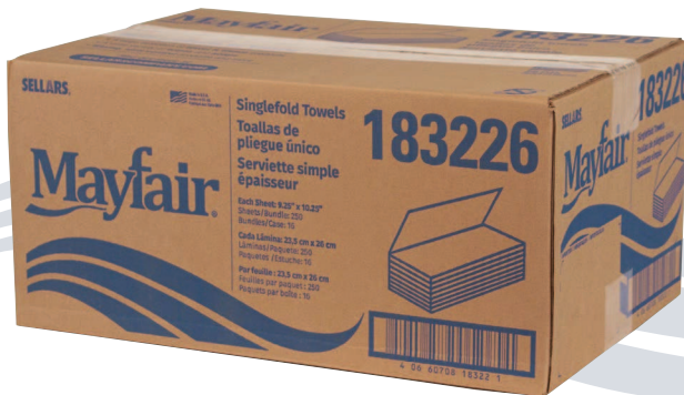
Natural Singlefold Towels Outer Case