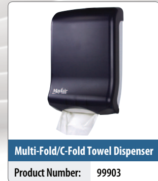
Multi-Fold/C-Fold Towel Dispenser