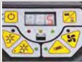
INTUITIVE CONTROL PANEL