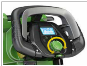
FULL MACHINE CONTROL DUE TO INTUITIVE CENTRAL KNOB