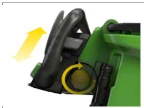
ADJUSTABLE HANDLE FOR A COMFORTABLE AND EASY USE