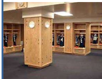
Restrooms & Showers